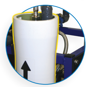
Gloss 300 psi FRP Housings, Stainless Available at No Additional Cost