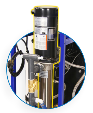
Multi Stage Booster Pumps