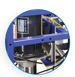
Easy Motor Mount Bracket

The VRO 440 Series is designed for Commercial or Light Industrial applications requiring flow rates of 0.17-6.9 gallons per minute (GPM). The VRO 440 Series features the durability of a powder coated steel frame, an optional complete performance monitoring package, and simple system integration.