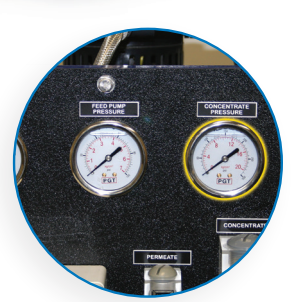
Liquid Filled Panel Mounted Concentrate Pressure Gauge