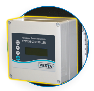
Optional - Control Box w/Low Pressure, Permeate TDS & Level Controls